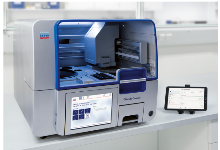
Figure 1. QIAcube Connect.

With our specially designed QIAcube versions of your favorite QIAamp®, DNeasy® and RNeasy® Kits, all these benefits are already available to you, if you want them.