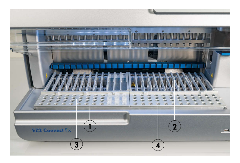
Figure 4. EZ2 Connect Fx Worktable.

The worktable of EZ2 Connect instruments is where the user-equipped cartridge and tip racks are placed (Figure 4). The display also shows protocol status during the automated procedure.