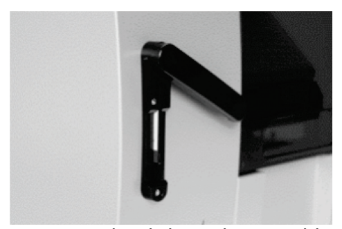
Figure 2. EZ1 Card completely inserted into EZ1 Card slot.

The instrument should only be switched on after an EZ1 Card is inserted. Make sure that the EZ1 Card is completely inserted (Figure 2). Otherwise, essential instrument data could be lost, leading to a memory error. Make sure to turn off the instrument before removing or replacing the EZ1 Cards; otherwise, a memory error can occur.