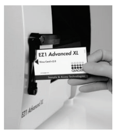
Figure 1. Ease of protocol setup using EZ1 Advanced XL Cards. Inserting an EZ1 Card, which contains a protocol, into the EZ1 Advanced XL instrument.