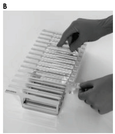
Figure 3. Ease of instrument setup using reagent cartridges. A: A sealed, prefilled reagent cartridge of the EZ1 ccfDNA Mini or Midi Kit. B: Loading reagent cartridges into the cartridge rack. The cartridge rack itself is labeled with an arrow to indicate the direction in which reagent cartridges must be loaded.