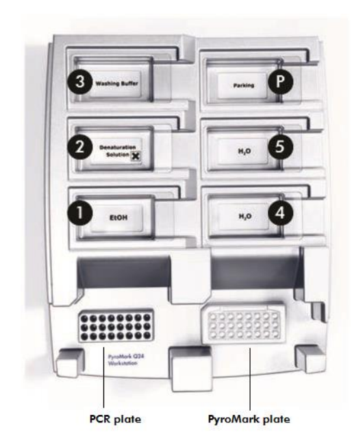
Figure 1. Placement of PCR plate and PyroMark Q24 Plate on the vacuum workstation.

Inspect the PCR plate and ensure the Sepharose beads are in solution. Ensure that the PCR plate is in the same orientation as when samples were loaded.