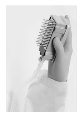
Figure 2. Illustration of the vacuum tool raised to beyond 90° vertical.