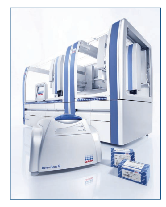
Figure 1. The QIAsymphony RGQ system.

64 clinical blood samples, which had previously been tested using the COBAS AmpliPrep/COBAS TaqMan HCV Test on the COBAS AmpliPrep Instrument and COBAS TaqMan Analyzer, were subsequently tested using the artus HCV QS-RGQ Kit on the QIAsymphony RGQ system according to manufacturer's instructions.