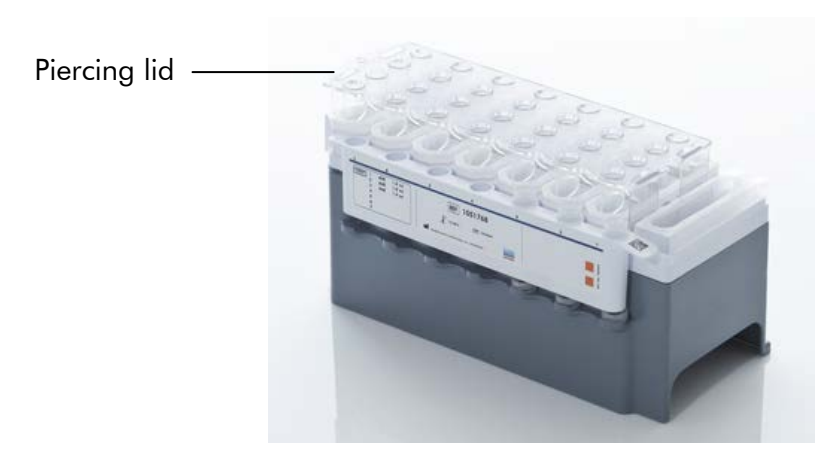
Figure 3. Easy worktable setup with reagent cartridges. The reagent cartridge with the piercing lid positioned in the reagent cartridge holder.

The reagent cartridge is then loaded into the "Reagents and Consumables" drawer.