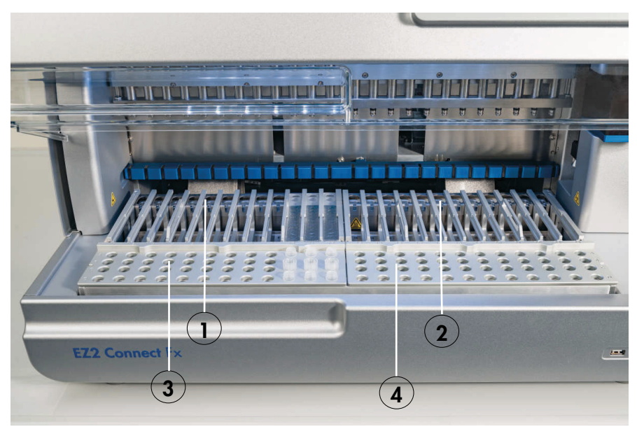
Figure 4. EZ2 Connect Worktable.