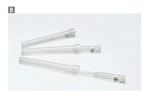
Figure 3. The EZ2 Connect Tip Rack. (A) Each Tip Rack has 4 positions, which are labeled A–D. (B) The rack is designed to hold sample and elution tubes as well as tips in their corresponding tip holders.