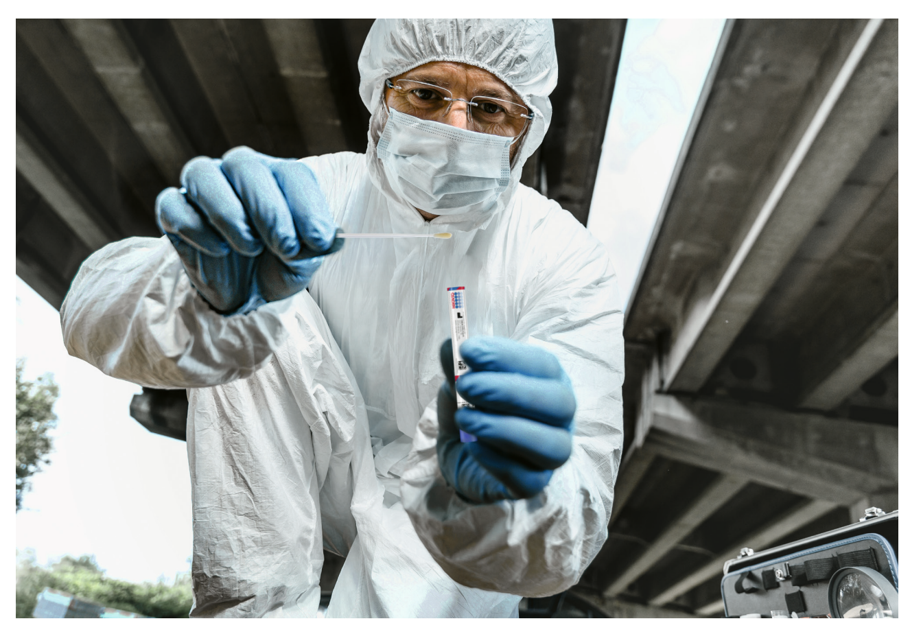
Figure 1. 4N6FLOQSwabs® represent a breakthrough to guarantee that even smallest amounts of DNA can be collected and remain available for testing.

Whether you are working in forensic casework, databasing, relationship testing or collecting data on missing persons cases, QIAGEN provides a solution for every step of your DNA workflow from sample to insight.