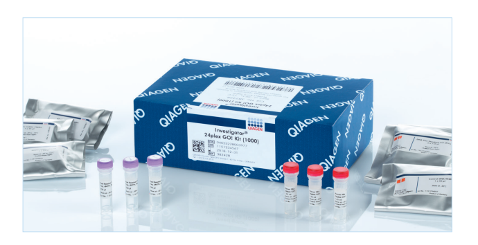
Figure 3. The Investigator 24plex GO! Kit.

The NDIS-approved Investigator 24plex GO! Kit is an expanded CODIS core loci [2] STR kit, designed specifically for direct amplification from database samples. The kit is highly robust ensuring excellent first-pass success rates, and includes QIAGEN's unique Quality Sensor – a quality control system that provides performance feedback for every sample, enabling the most intelligent rework strategy for any problematic samples.