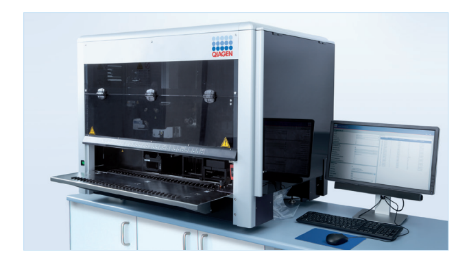
Figure 2. The Hamilton easyPunch STARlet.

The Hamilton easyPunch STARlet liquid-handling workstation integrates sample collection card imaging, punching and liquid handling capability all in one instrument. The system enables full sample tracking, including the recording of card images that completely account for the consumption of evidence.