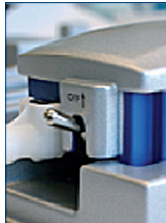
Vacuum switch OFF.