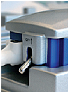
Vacuum switch ON.

Always wear a suitable lab coat, disposable gloves, and protective goggles. For more information, see the PyroMark Q24 User Manual (and the MSDS).