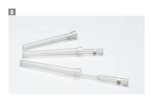
Figure 3. The EZ2 Connect Tip Rack (A) has 4 positions label A–D by engravings. It is designed to hold sample and elution tubes as well as tips in their respective tip holders (B).