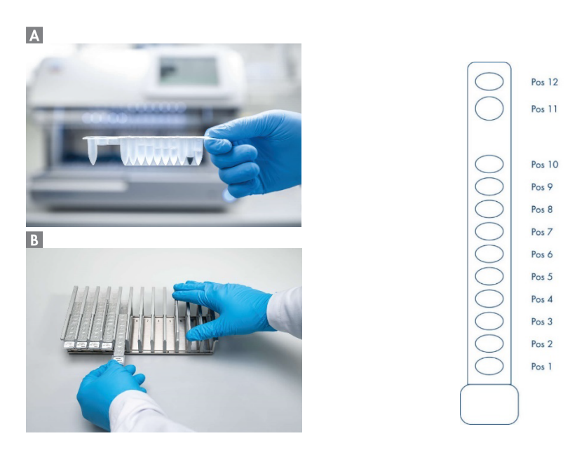
Figure 2. Ease of worktable setup using reagent cartridges. (A) A sealed, prefilled reagent cartridge. Fill levels vary, depending on the type of reagent cartridge. (B) Loading reagent cartridges into the cartridge rack. The cartridge rack itself is labeled with an arrow to indicate the direction in which reagent cartridges must be loaded. Each reagent cartridge contains 12 individual positions.

Reagents for the purification of nucleic acids from a single sample are contained in a single reagent cartridge (Figure 2). Each well of the cartridge contains a particular reagent, such as magnetic particles, lysis buffer, wash buffer, or elution buffer. Positions 11 and 12 can be equipped individually. Details on preparation of these positions are displayed during the run setup on the LED display of the EZ2 Connect.