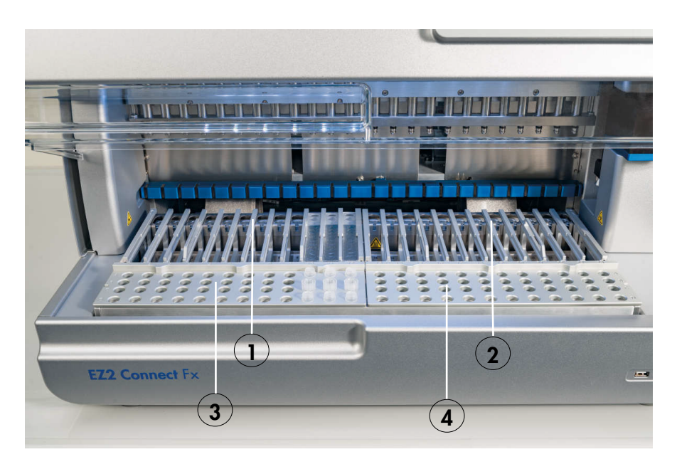
Figure 4. EZ2 Connect Worktable.