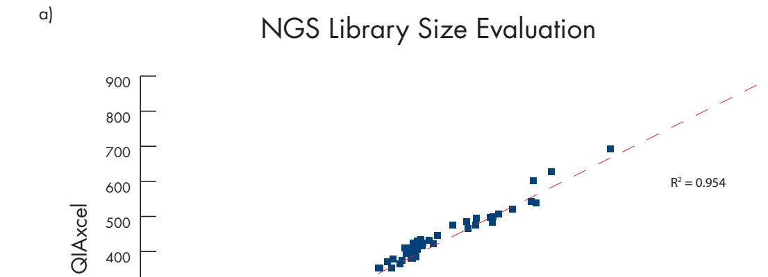
NGS Library Size Degree of Agreement