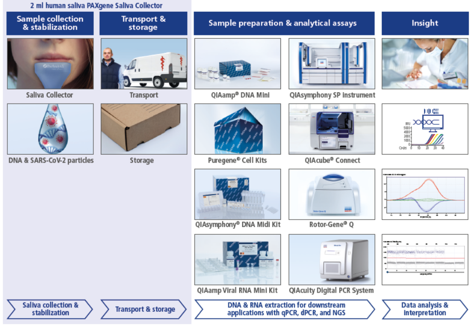
Figure 1. PAXgene Saliva workflow . Saliva collected into PAXgene Saliva Collectors can be used to process DNA with QIAGEN manual and automated extraction methods such as the QIAamp® DNA Mini and Puregene® Cell Kits or the QIAsymphony® DNA Midi Kit on the QIAsymphony SP instrument and the QIAamp DNA Mini Kit on the QIAcube® (Classic and Connect). SARS-CoV-2 RNA can be isolated with the QIAamp Viral RNA Mini Kit. Obtained nucleic acids can be used for molecular test methods including qPCR, dPCR, and NGS.

PreAnalytiX developed the PAXgene Saliva workflow to minimize post-collection changes caused by preanalytical variables and to standardize the preanalytical steps from saliva collection until nucleic acid is available for molecular analyses.