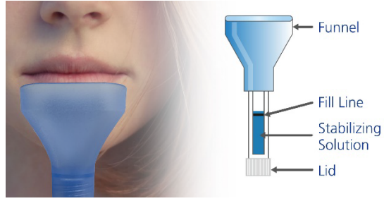
Figure 2. PAXgene Saliva Collector.

has bacteriostatic properties that inhibit bacterial growth over storage time. It is free of crosslinking or nucleic-acid-modifying substances.