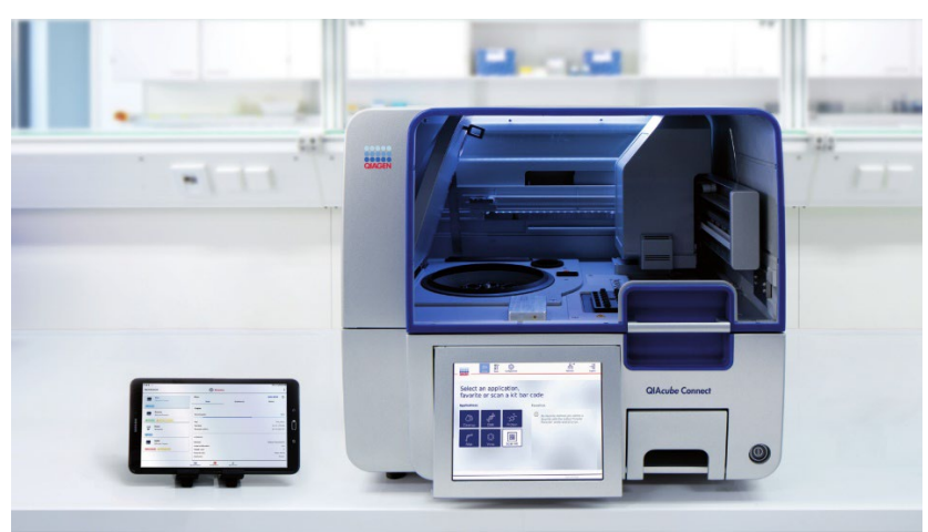
Figure 1. QIAcube Connect.

QIAcube instruments are preinstalled with protocols for purification of plasmid DNA, genomic DNA, RNA, viral nucleic acids and proteins, plus DNA and RNA cleanup. The range of protocols available is continually expanding, and additional QIAGEN protocols can be downloaded free of charge at www.qiagen.com/qiacubeprotocols