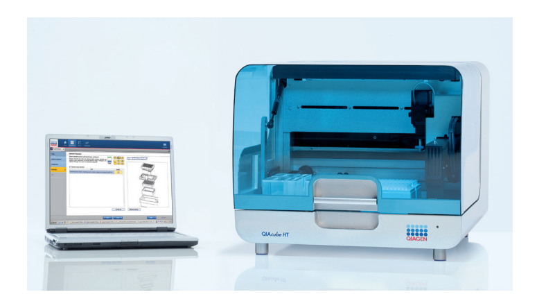
Figure 1. The QIAcube HT system.

The software is able to read or directly import sample input files during experiment setup, avoiding errors from manually typing in sample ID and position information. The software supports *.xml format, as well as a simple *.csv or *.txt format. When an experiment is finished, the system optionally generates an XML output file describing the output labware. While a report is generated as a PDF for optimized printing, the additional XML output file is intended for automated computer processing.