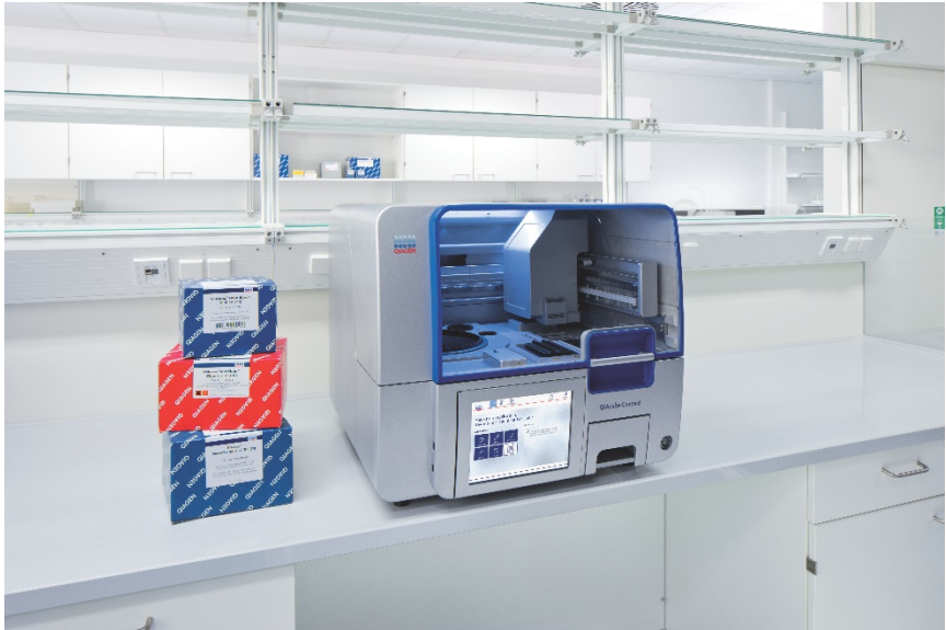
Figure 1. QIAcube Connect