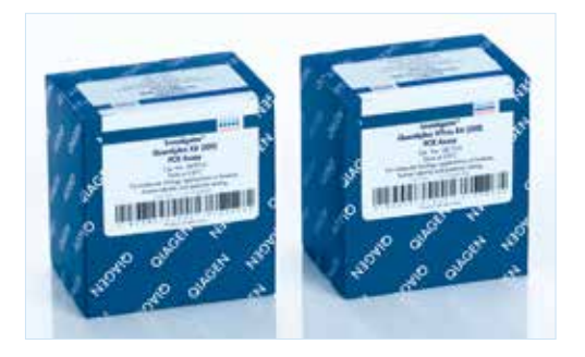
Figure 1. Investigator Quantiplex and Investigator Quantiplex HYres Kits.