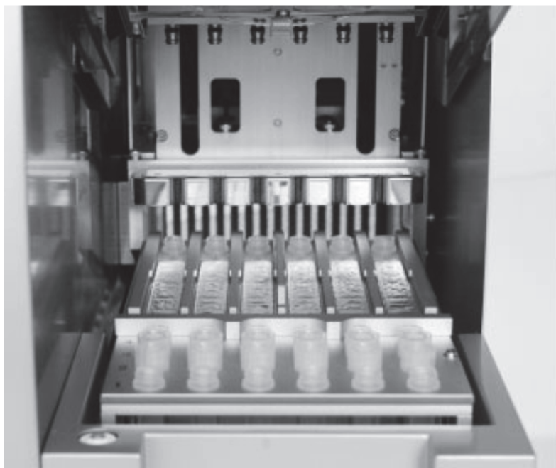
Figure 4. Typical EZ1 worktable.