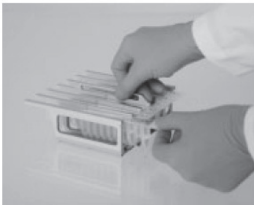
Figure 3. Ease of setup using reagent cartridges. [A] A sealed, prefilled reagent cartridge. Fill levels vary, depending on the type of reagent cartridge. [B] Loading reagent cartridges into the cartridge rack. The cartridge rack itself is labeled with an arrow to indicate the direction in which reagent cartridges must be loaded.