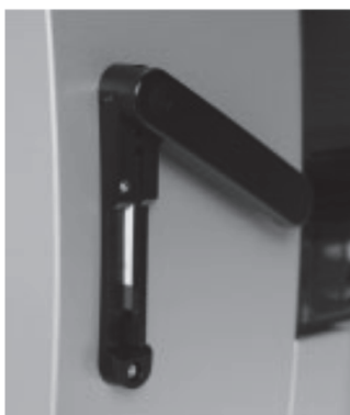
Figure 2. Complete insertion of EZ1 Card. The EZ1 Card must be completely inserted before the EZ1 instrument is switched on.

EZ1 instruments should only be switched on after an EZ1 Card is inserted. Make sure that the EZ1 Card is completely inserted (see Figure 2) otherwise essential instrument data could be lost, leading to a memory error. EZ1 Cards should not be exchanged while the instrument is switched on.