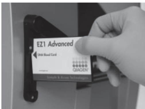
Figure 1. Ease of protocol setup using EZ1 Cards. Inserting an EZ1 Card, containing a protocol, into an EZ1 instrument. The instrument should only be switched on after an EZ1 Card is inserted. EZ1 Cards should not be exchanged while the instrument is switched on.

Protocols for nucleic acid purification are stored on preprogrammed EZ1 Cards (integrated circuit cards). The user simply inserts an EZ1 Advanced XL Card into the EZ1 Advanced XL; an EZ1 Advanced Card into the EZ1 Advanced; or an EZ1 Card into the BioRobot EZ1, and the instrument is then ready to run a protocol (see Figure 1). The availability of various protocols increases the flexibility of EZ1 instruments. Note that the Flip-Cap Tube Rack can only be used with the EZ1 DNA Investigator Flip-Cap card on an EZ1 ADV XL.