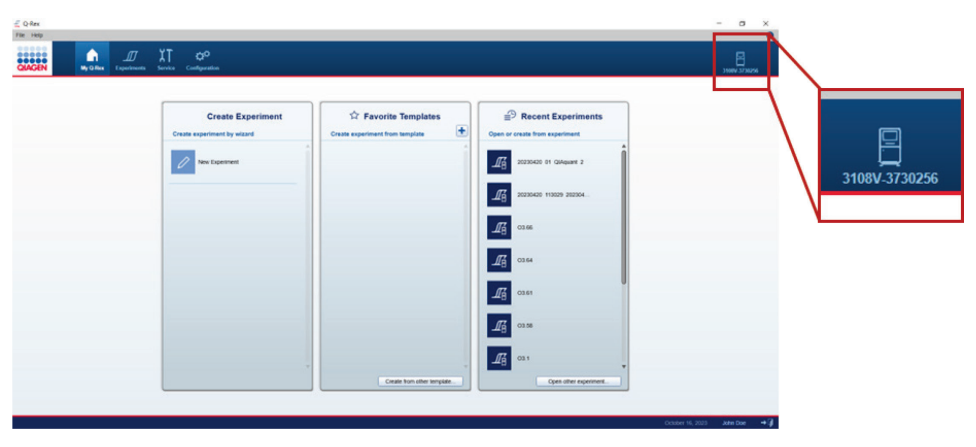
Serial number displayed within the Q-Rex Software.

For QIAquant instruments with the serial number prefix 3107, we recommend using the QIAquant Software. When using the Q-Rex Software with 3107 instruments, limitations within the data analysis might occur. The limitations affect the crosstalk correction within the Q-Rex Software, that is recommended to be used when using neighboring channels for acquisition, as it has been optimized for the QIAquant instruments with serial number prefix 3108.