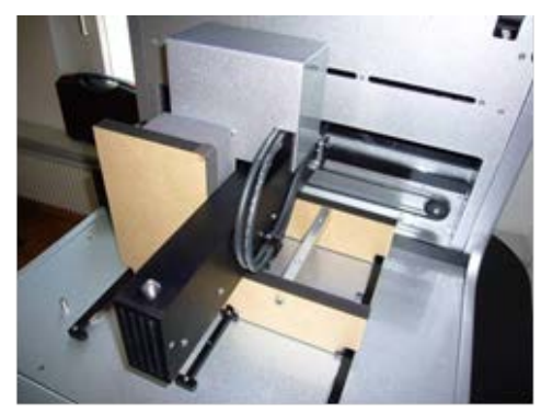
10. Move the pipettor head to the right and remove the transport lock from the worktable.