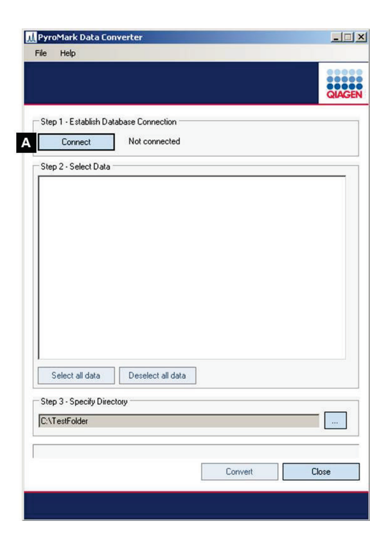
Figure 1. PyroMark Data Converter main window