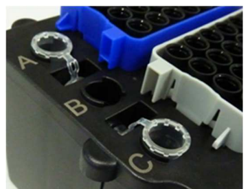
Figure 3. Microcentrifuge tube slots. Microcentrifuge tube slot B is not used in this protocol.

Note: Microcentrifuge tube slot B remains empty.