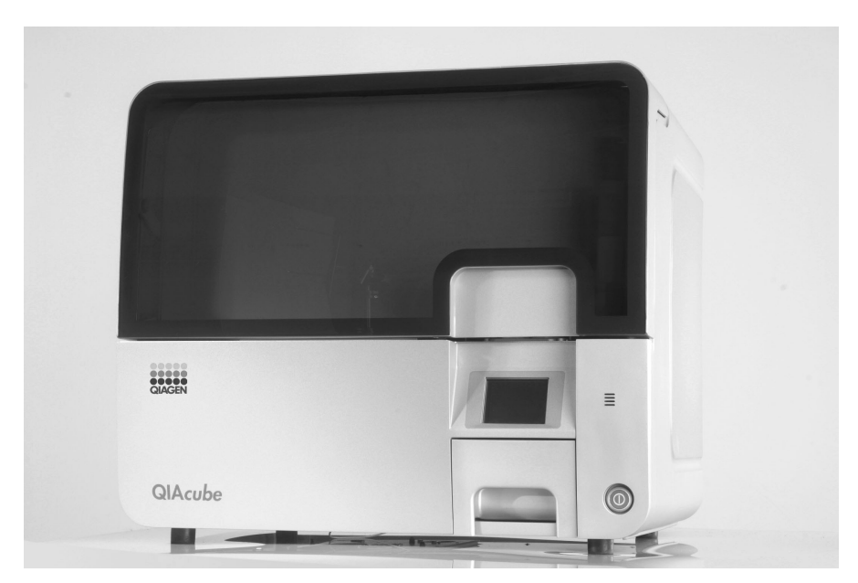
Figure 1. Automated DNA purification. DNA purification using the QIAamp DNA Stool Mini Kit can be automated on the QIAcube.