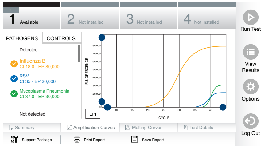
QIAstat-Dx Respiratory Panel Plus