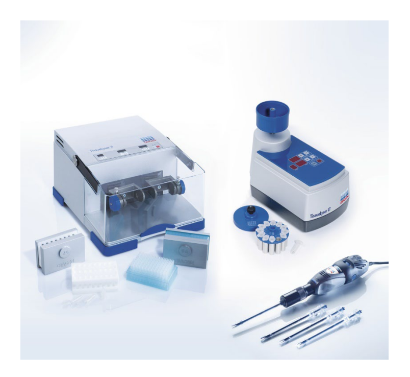
Figure 3. The TissueLyser II, TissueLyser LT, and TissueRuptor II for sample disruption.

An instruction manual is provided with the TissueLyser. Read this manual carefully before using the TissueLyser. Do not use the TissueLyser with equipment other than that supplied.