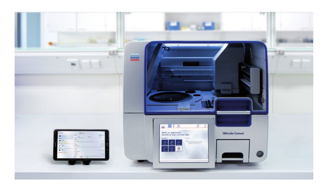
Figure 2. QIAcube Connect.